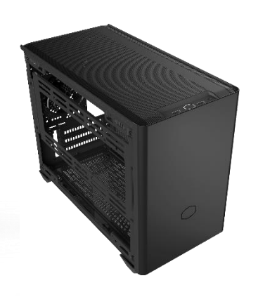
Unrestricted Cooling Potential

A PCI Riser is included for vertical GPU installation.