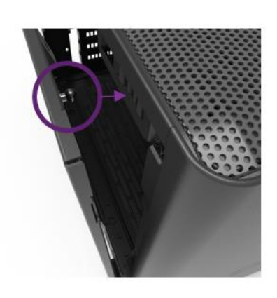
Easy, Tool-free access

A custom-sized riser cable is included to mount a graphics card vertically to showcase it, or allow radiator mounting at the bottom of the chassis.