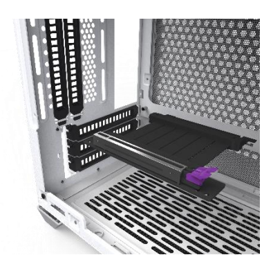
Triple-slot GPU support and Included Vertical Riser Cable

CPU coolers up to 155mm in height and radiators up to 280mm are natively supported.