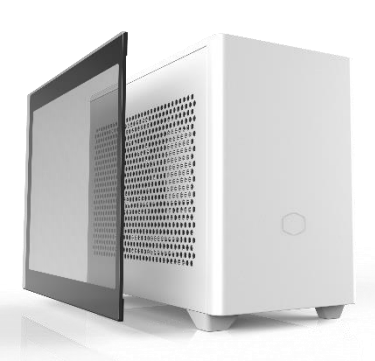
Limited Size, Unlimited Options

The NR200P comes with the choice of a vented steel side panel for unrestricted airflow, or a crystal-clear tempered glass side panel to reveal the beauty of a computing beast.