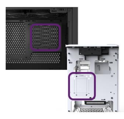
Out-of-the-box Custom Cooling Support

Screws are used to secure the frame parts to allow advanced disassembly and multiple angles to easily work inside of the chassis.