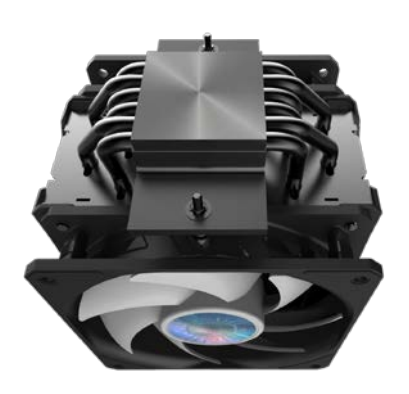
Nickle Plating Copper Base

6 heat pipes work efficiently to deliver exceptional heat removal