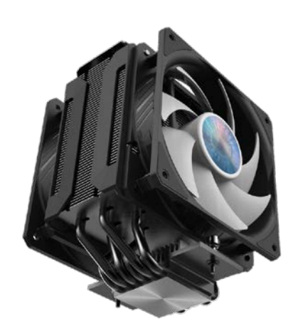
Stealth Black Hardware

All-black hardware throughout offers a darkened premium look