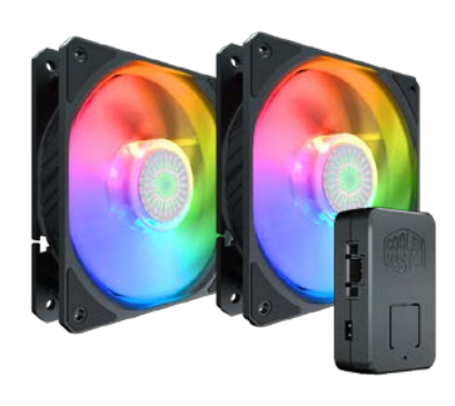
Dual SickleFlow 120 ARGB Fan

Black aluminum top cover offers a premium finish