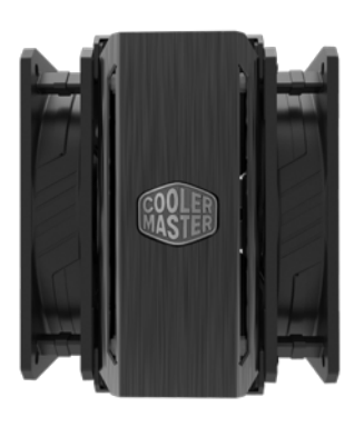
Premium Aluminum Black Top Cover

Nickel plated copper base provides maximum coverage for optimal cooling