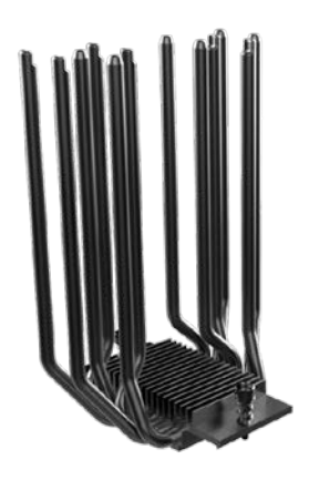
6 Heat Pipes Array

Assures RAM compatibility and clearance space across various motherboard platforms