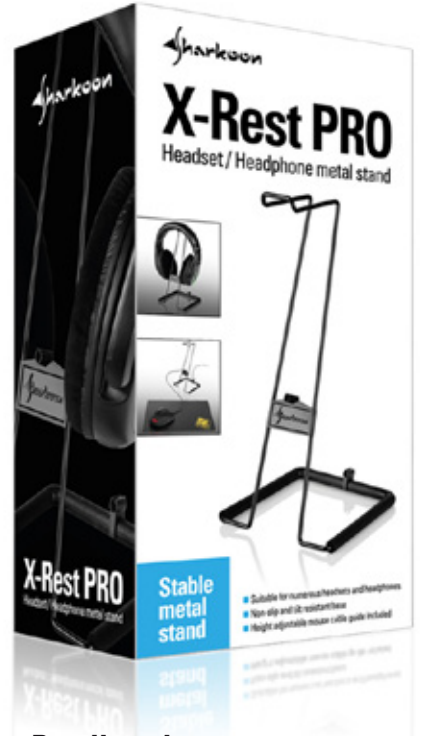
Retail package: Dimensions: 280 x 150 x 100 mm Weight: ~380 g