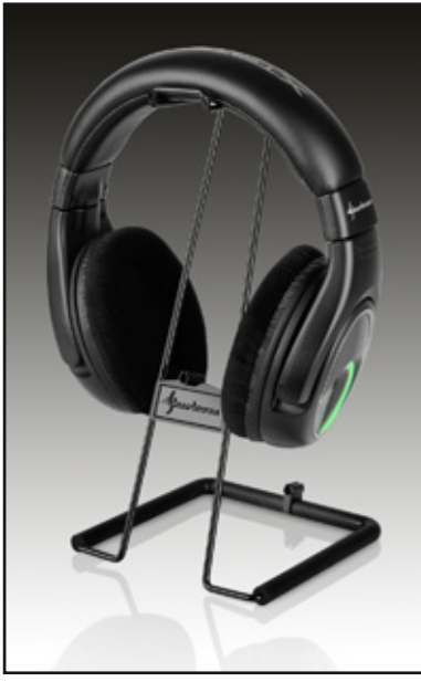
Suitable for numerous headsets and headphones

Headset stand with included mouse cable guide