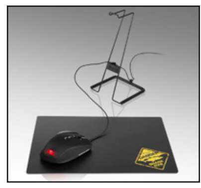
Including mouse cable guide